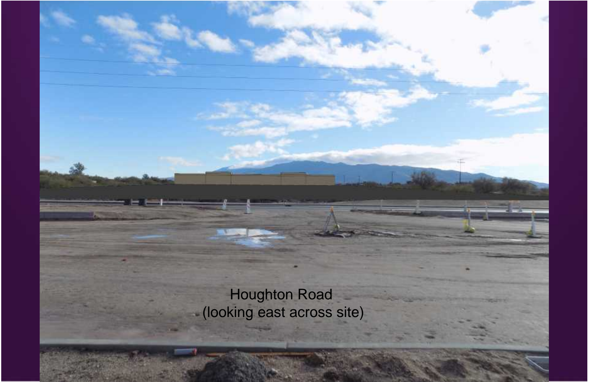
Houghton Road (looking east across site)