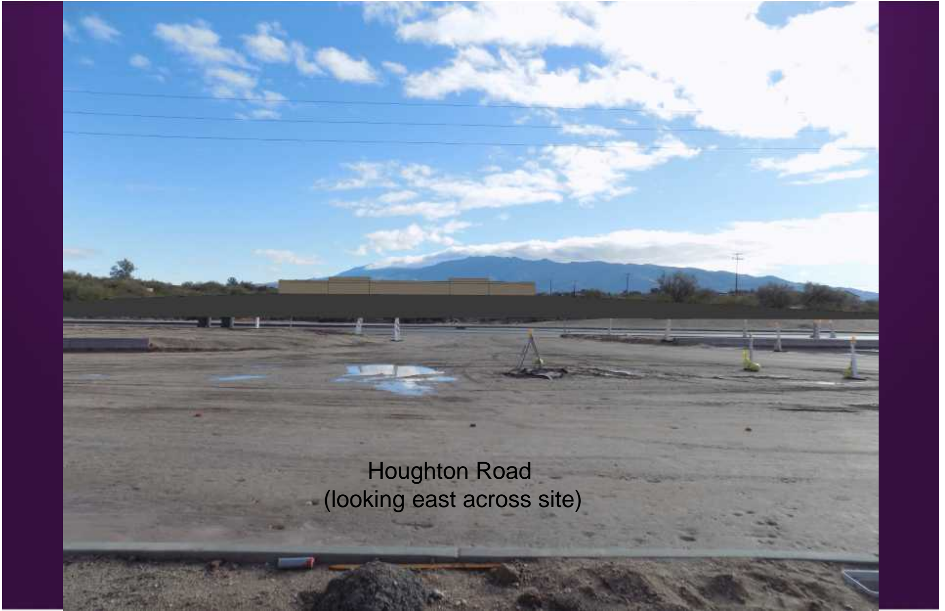
Houghton Road (looking east across site)